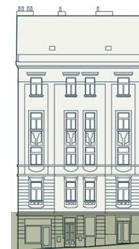
Situation on the floor