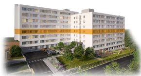
POSITION WITHIN FLOOR